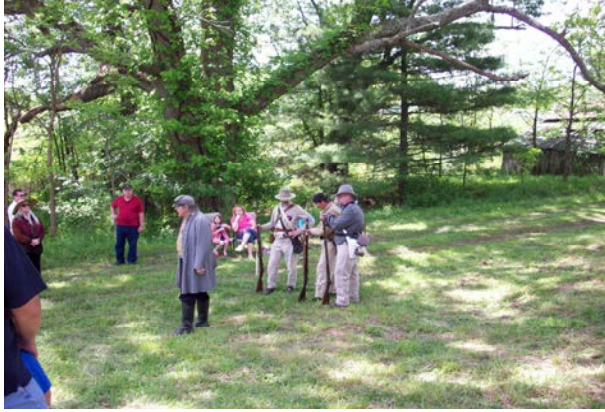
Shooting Demonstration from The New River Rifles