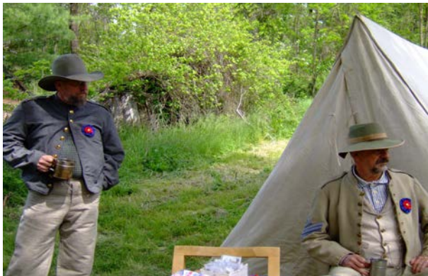
New River Rifles Camp