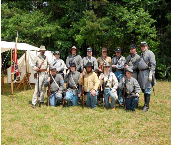
New River Rifles

The New River Rifles Reenactment Group will be on hand to portray the 24 th VA Infantry and the 83 rd PA.