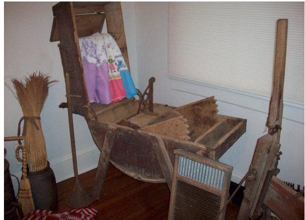
Early Washing Machine