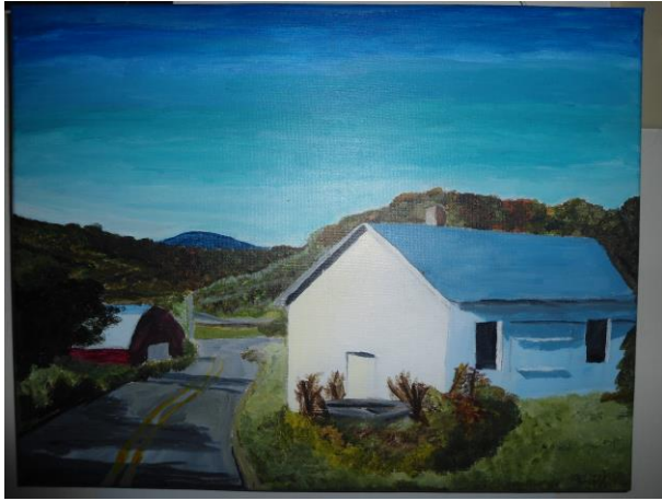
Union School- Burks Fork District painted by Taryn Brewer