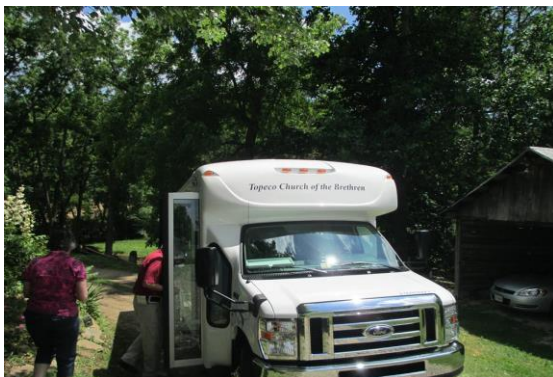
People boarding the Topeco Bus for tours

An OnCell Audio Tour is now available by calling 540-585-3070 for both Laurel Branch Driving Tour and the Museum's Education Exhibit.