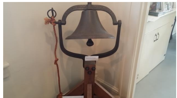
Bell from a school on Strick Sweeney farm on Dusty Rock Road