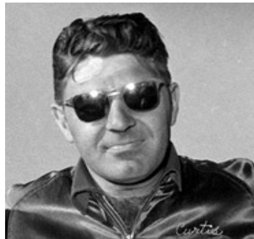
Curtis Turner 1924-1970

EcoVillage Center, 718 Franklin Pike, Floyd, VA. Directions: off the Old Franklin Pike between Hwy 221 & Shooting Creek Road.