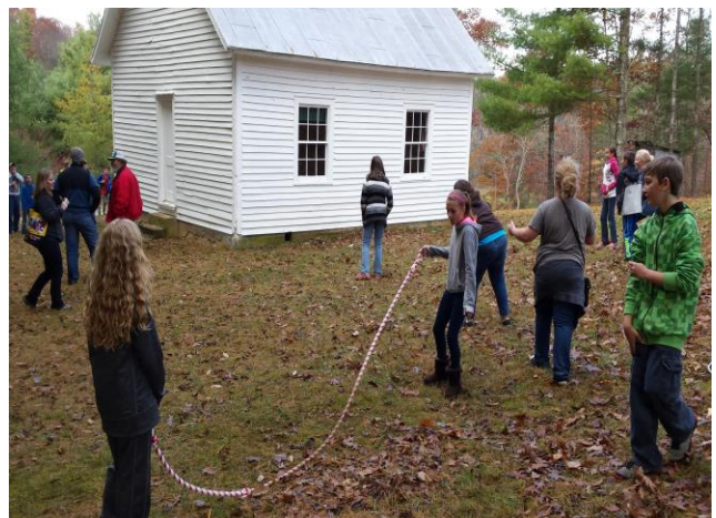
Willis Elementary at Double Springs School